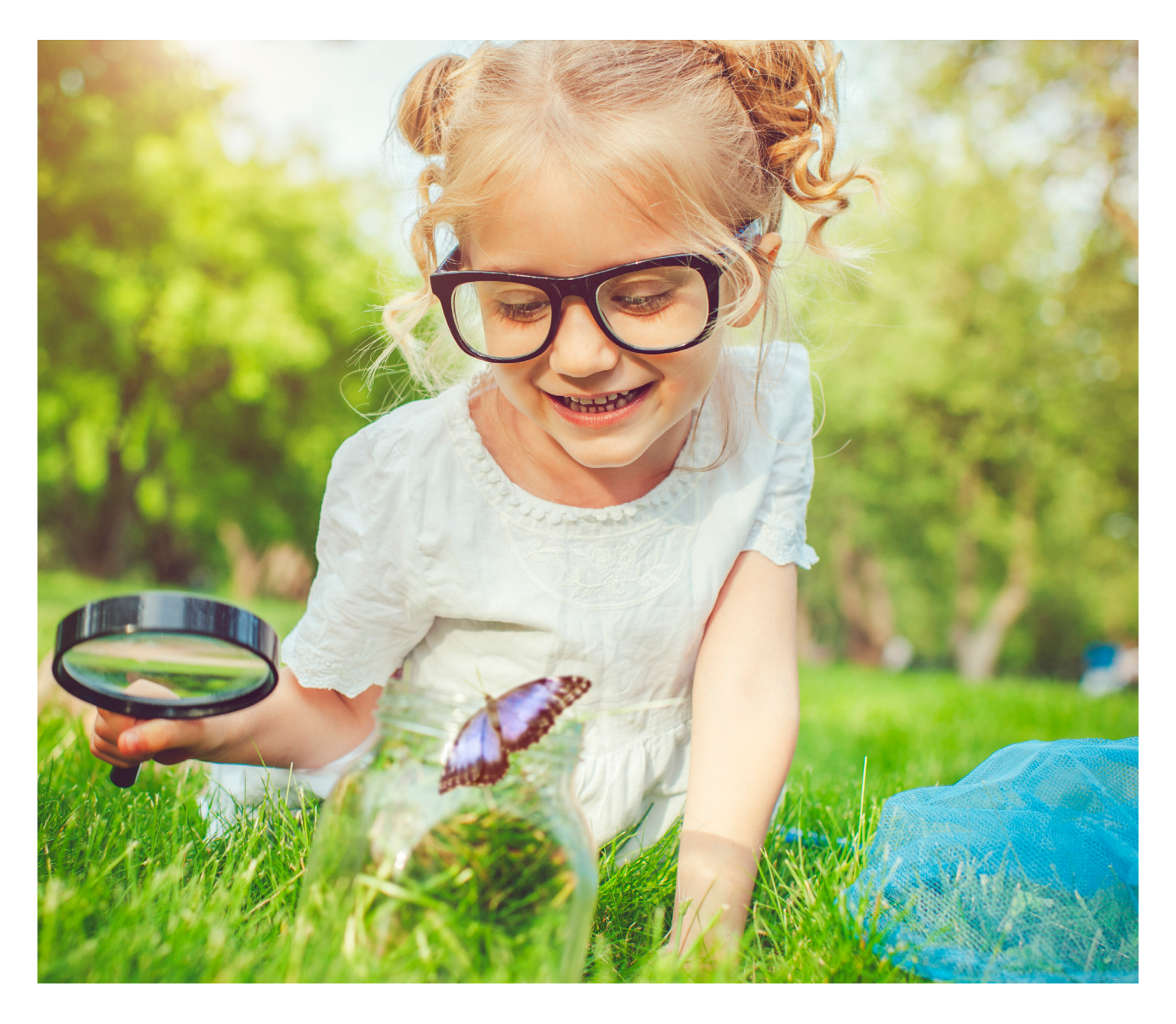
A big EYEDEA from Delta Dental