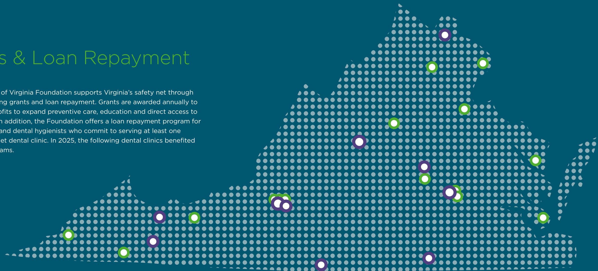
Grantees appear in green, loan repayment appears in purple

The Delta Dental of Virginia Foundation supports Virginia's safety net through programs including grants and loan repayment. Grants are awarded annually to qualifying nonprofits to expand preventive care, education and direct access to dental services. In addition, the Foundation offers a loan repayment program for Virginia dentists and dental hygienists who commit to serving at least one year in a safety-net dental clinic. In 2025, the following dental clinics benefited from these programs.