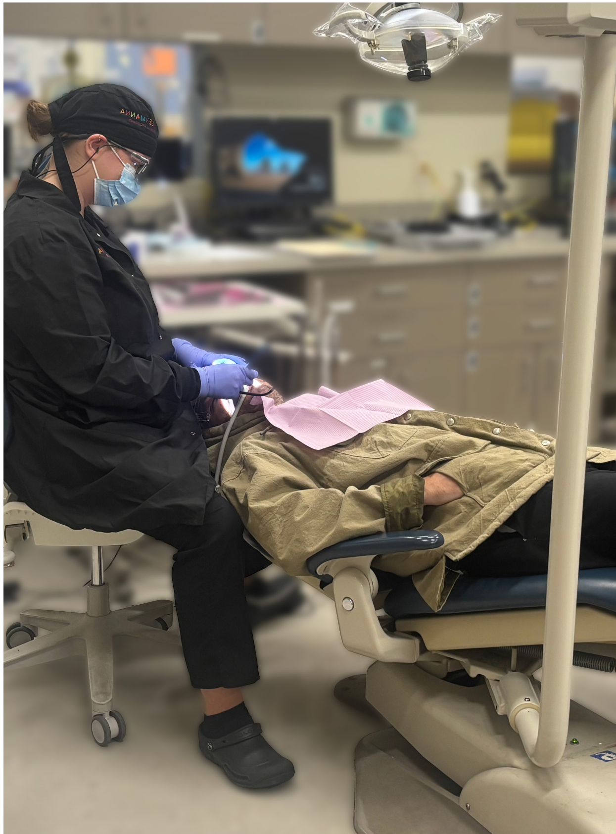
GERMANNA COMMUNITY COLLEGE DENTAL HYGIENIST PROVIDING SERVICES TO A PATIENT.