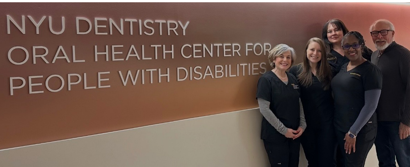
VCU SCHOOL OF DENTISTRY TEAM ATTENDING TRAINING AT NYU DENTISTRY.